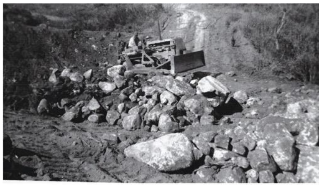
1951 Francis Gillian bulldozing a landing strip for the Waco plane. The 1<sup>st</sup> runway was 600 feet along N. Stagecoach Ln. The 2<sup>nd</sup> runway was only a 300 foot strip overlooking the Santa Margarita River. ( Gillian Collection ).

The new runway worked well, but the surrounding land owners complained the airplane noise frightened their livestock. The unapproved airfield had to be discontinued.