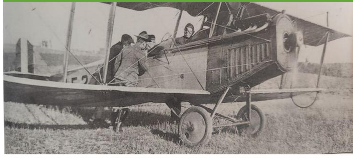
April 1918. Handwriting on the back of the photo describes this as the 1<sup>st</sup> airplane to land in Fallbrook. The field is on the mesa of Rancho Santa Margarita, just SW of the center of Fallbrook. The Curtiss JN "Jenny" airplane was widely used for training pilots. The vertical tri-color on the tail rudder was in use at this time for squadrons at North Island, San Diego.