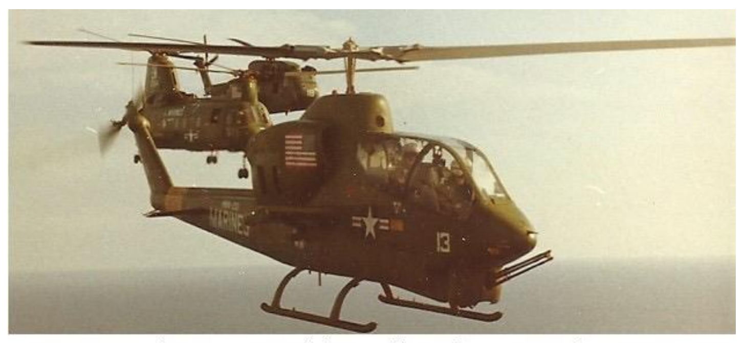
Three Marine Corps helicopters flying in formation over the sea, from front to rear: a Bell Cobra, a Boeing Vertol Sea Knight, and a Sikorsky Sea Stallion, are examples of Marine Corps aircraft that have often been seen passing over Fallbrook at high altitudes since the 1960s.

In August of 1963 a deal was finalized; the federal government granted title to the land, to be used as an airport only. Fallbrook finally had its permanent civilian airpark, where it is today.