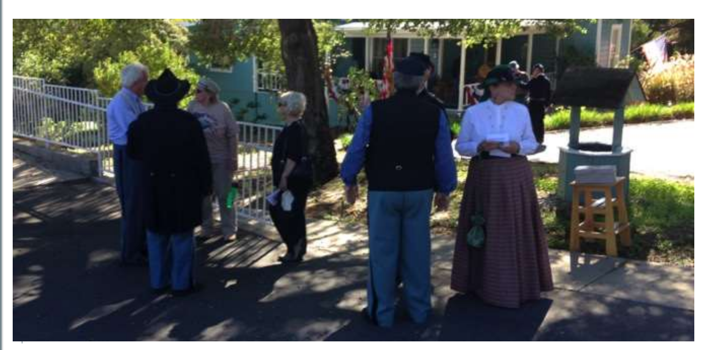
Last year's ceremony featuring Sons and Daughters of Union Veterans of the Civil War in period costumes and reenactment uniforms at the Pittenger House

All are welcome to help honor these heroes Mark your calendars and join us