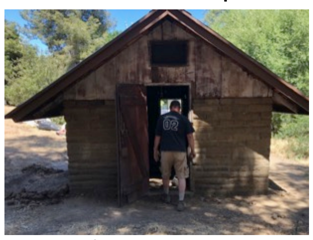
Watch for announcements of the Open House in September