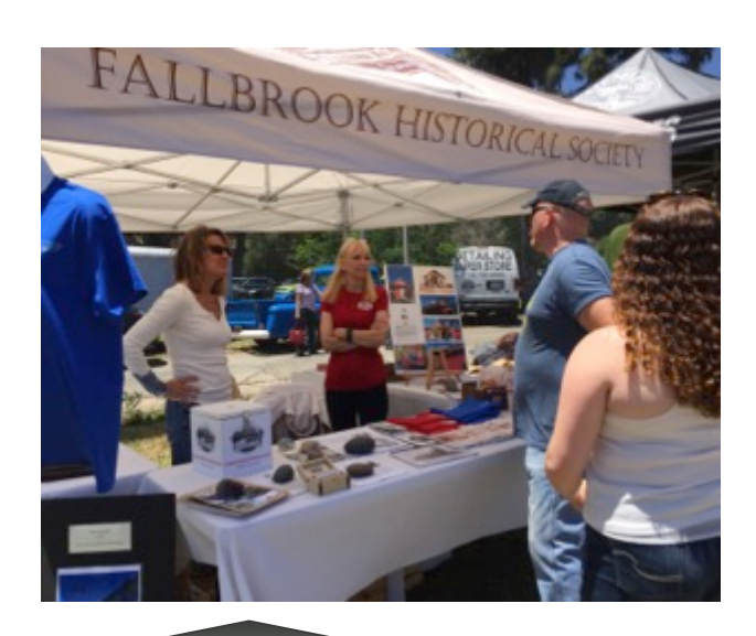
Conversations at the FHS Booth at the Vintage Car Show May 27th