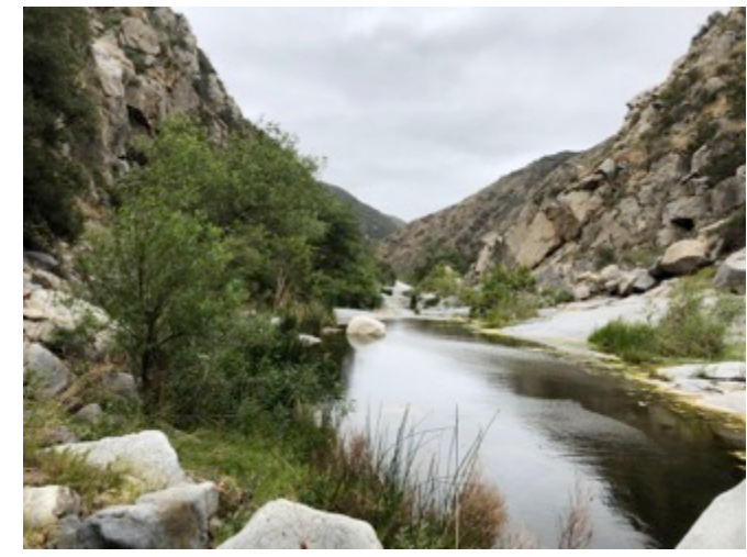
Fallbrook's Caboose Coming Soon!!

Track routes still visible where the Fallbrook train traversed Santa Margarita Canyon in the early 1900's. FHS members enjoyed informative talks about the railroad history in this area as well as the guided hikes through the awe-inspiring terrain and reserve.