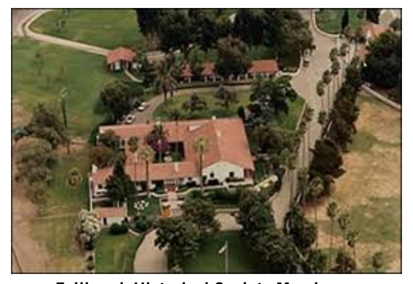
Fallbrook Historical Society Members visit Rancho Santa Margarita y Las Flores Museum Camp Joseph H. Pendleton

Past issues of TIME AGAIN are available on the FHS Webpage at: www.fallbrookhistoricalsociety.com