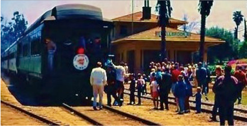
Fallbrook Train Station built in 1923

A monthly publication of the Fallbrook Historical Society